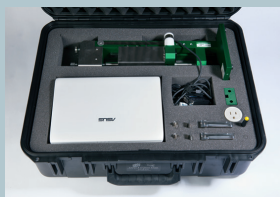
Model 3590VHR calibrator storage case

See the Model 3590VHR extensometer videos