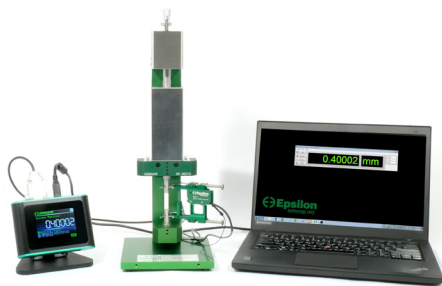
Model 3590VHR calibrator with included Touch Display digital readout and software (computer optional)

The 3590VHR calibrator has the high resolution and accuracy required to calibrate and verify extensometers to ASTM E83 Class B-1 and to ISO 9513 Class 0,5. The 3590VHR's resolution is 20 nanometers.