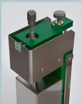
Coarse and fine adjustment knobs for fast and accurate positioning

A wide range of adapters are available to allow use with axial, transverse, shear, and many other specialized extensometers. The calibrator comes with round adapters (9.52 mm [0.375 inches] diameter) that work with many typical axial extensometers. Specialized adapters are available. For very long gauge length extensometers, optional extension posts are available.