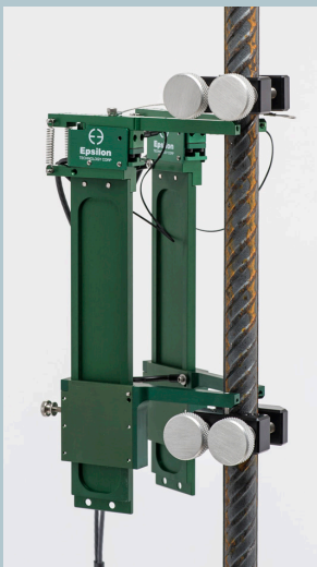
Model 3567 with mounting collars (rebar coupler not shown)