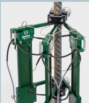
Option for average of three measurements (rebar coupler not shown)

Model 3567 extensometers are strain gaged devices, making them compatible with any electronics designed for strain gaged transducers. Most often they are connected to a test machine controller and Epsilon will equip the extensometer with compatible connectors that are wired to plug directly into the controller. For systems lacking the required electronics, Epsilon can provide a variety of solutions for signal conditioning and connection to data acquisition systems or other equipment.