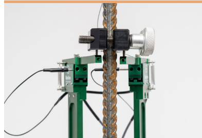
Model 3567 specimen attachment collar with extensometer installed

The Model 3567 extensometer may be used for ASTM A1034 testing to measure strain and elongation during tension testing of rebar splice assemblies consisting of rebar and rebar couplers, coupling sleeves and splices. The extensometer measures strain through yield and may be used for tension, cyclic, slip, and differential elongation tests.