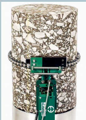
Model 3544-0400 with 1.25 inch to 4 inch diameter range

See the electronics section of this catalog for available signal conditioners and strain meters.