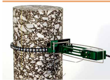
Model 3544 in a horizontal body style

Designed for concrete and rock compression testing or for compression tests on other large samples. This model may be used simultaneously with the Model 3542RA axial extensometers.